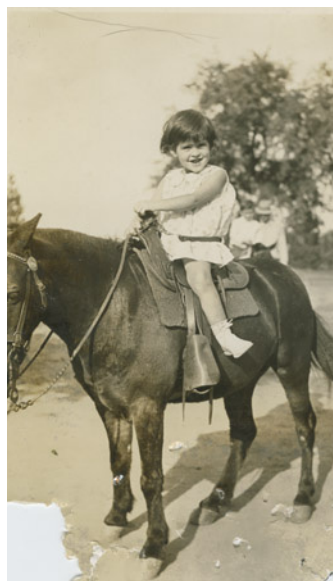
BEFORE - Photo 2