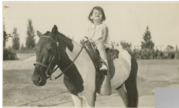
BEFORE - Photo 1